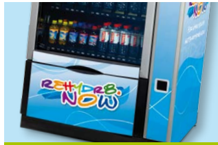
Innovation Page 2