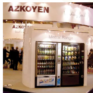
Our new machine featured on the Azkoyen stand at Avex 2007 in London

“You could say, we know our machines inside and out of the box!”