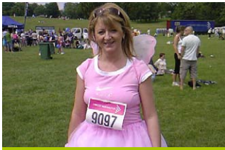
Fun & games! Page 3