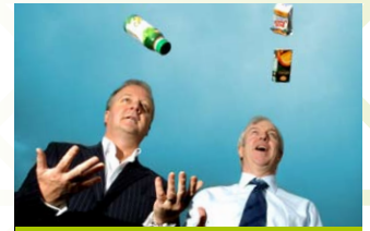
Compliance Page 2