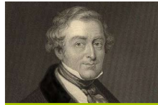
Bury interesting Page 4